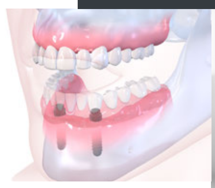
Straumann® Novaloc Retentive System with regular implants