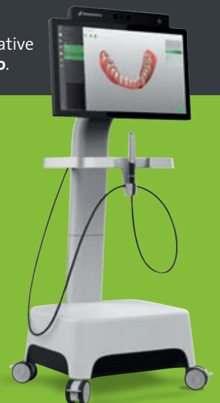
Straumann® Virtuo Vivo™

Contact your local Straumann® representative to schedule a live demo .